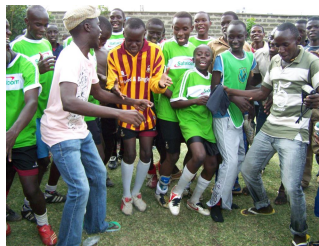
The joy safaricom brought to the slums it was all dancing and celebrating. Thanks to companies as Safaricom

Football (YDF) after being invited by our network partner from Rwanda Esperance who have been educating us on the project since 2009 and also hosted cara-