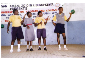
Children performing a poem on climate change event we did in Josana Academy

This will be a league that takes 3 months and the games will be played on weekends. With this tournament we would like to bring a change in the living conditions and the position of the youth of Kisumu. Sporting together and having a serious input, will benefit the children mentally and physically. Moreover, the tournament will stimulate its members to be active in their community. These activities will include cleaning up the neighborhood, education campaigns on the danger of HIV/ AIDS & malaria with the hope to stem the rate of infection and illness. This will be done every Saturday where every team will be required to do something for their community either cleaning market areas,clearing bushes or do a campaign on global issues like drug addiction,HIV/AIDS among others then on Sundays they play other teams in their Group